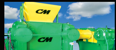
Stage #4 Crackermill w/Screening & Cleaning