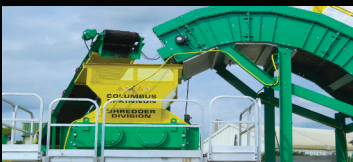
Stage #1 Shredder