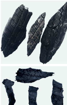
4"- 6" CHIPS