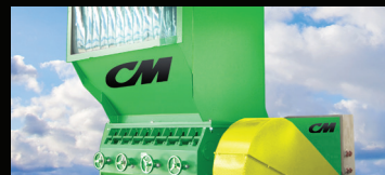
Stage #3 Granulator w/Fiber Removal