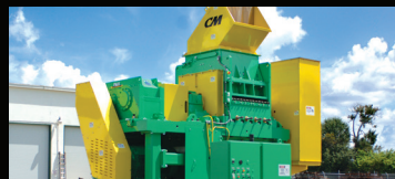
Stage #2 Liberator w/Steel Reclaim