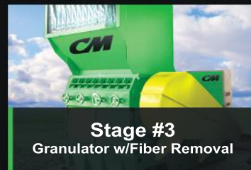
Stage #3 Granulator w/Fiber Removal