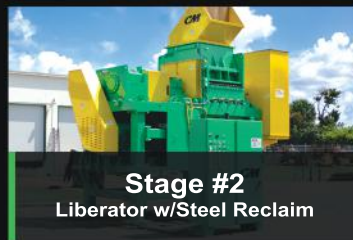
Stage #2 Liberator w/Steel Reclaim