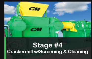
Stage #4 Crackermill w/Screening & Cleaning