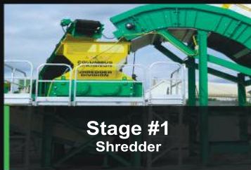
Stage #1 Shredder