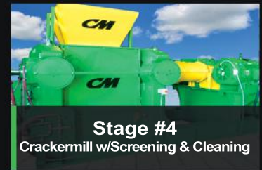
Stage #4 Crackmill w/Screening & Cleaning