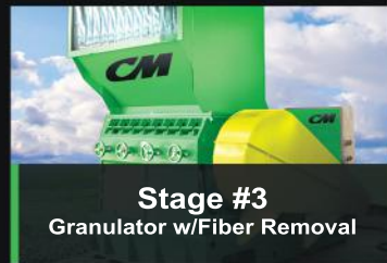
Stage #3 Granulator w/Fiber Removal