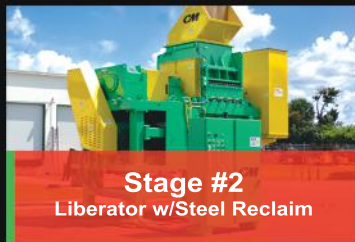
Stage #2 Liberator w/Steel Reclaim